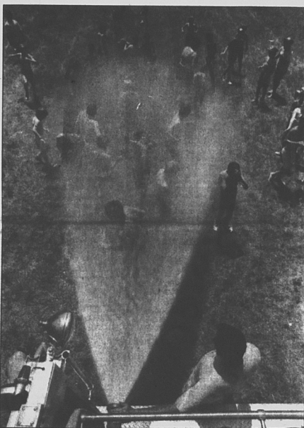
Alapaha Area Council Cub Scouts enjoy a cool spray from a Lakeland/Lanier County Volunteer fire truck while at Camp Patten in Lanier County Wednesday. The fire department has

The actions completed the County Commission's change of heart on the issue begun last week.